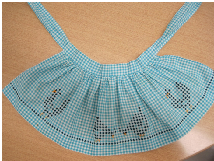
The small apron shown above has cross stitched chickens and was given to a Guild member when she was three years old.

Finders/Seekers: For Sale: A Disney Ult 2003D embroidery machine. can be used as a regular domestic also. 3 hoops and cases for all and manual Nice unit. $950.00 Also for sale:Husqvarna Lily sewing machine and manual. Good condition $750.00 Phone: 319.648.5810 ask for Colleen